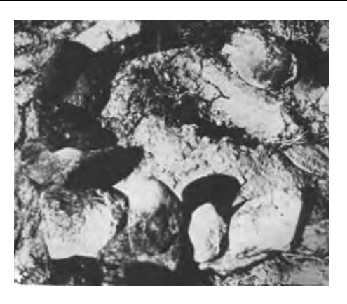
One of the four impressions found at the Socorro site.