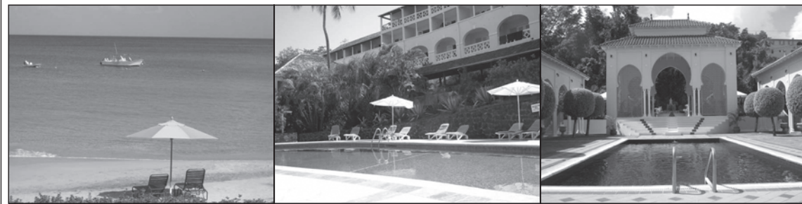
Le Sport St. Lucia

The 2008 edition of Caribbean Trends in the Hotel Industry finds that the industry faces some strong challenges. For 2008, the combination of a slow U.S. economy, increased competition, rising energy costs, and threats of reduced air services could result in lower levels of occupancy and profits for the region's hotel owners and operators.