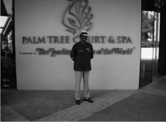
Photograph B: Concierge