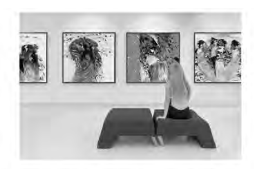
Im Nolde Museum in Seebüll im nordfriesischen Schleswig-Holstein wird Kunst zu einem Rundum-Erlebnis.