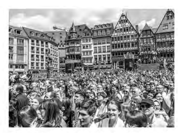
Abendveranstaltung in Frankfurt zum 25. Jahrestag der Wiedervereinigung

Pläne für die große Feier 2018 in Berlin Wo: Straße des 17. Juni (Berlin-Mitte) Wann: Mittwoch, 03.10.2018