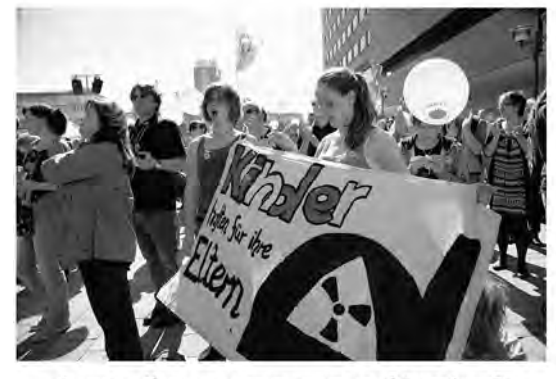
Jugendbewegung gegen Atomkraft