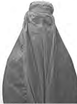
Burka und Niqab: verboten