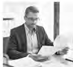
jährlich ca. 60 000 Menschen, die ihre Stasi-Akte einsehen