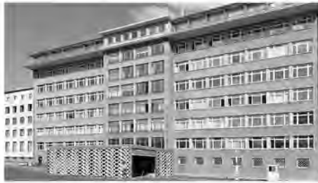
ehemalige Stasi-Zentrale in Ost-Berlin

40 Jahre lang überwachte die Stasi in der DDR die Bürger.