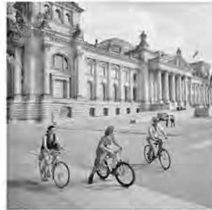
Seit 2006: die durchgehende Fahrradroute ‚Berliner Mauerweg‘