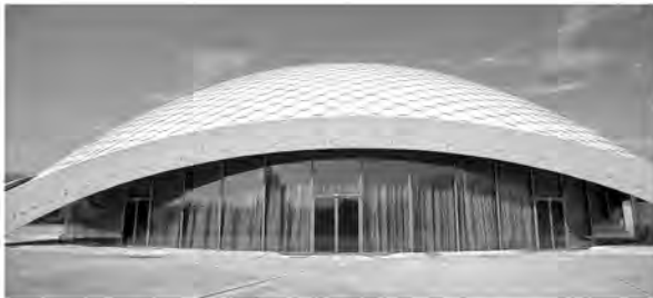
Große Veranstaltungen in der „Jahrhunderthalle“ in Frankfurt