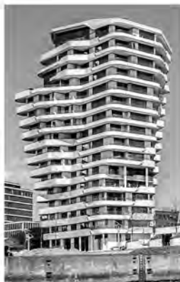
Exklusives Wohnen im „Marco-Polo-Turm“ in der Hamburger Hafencity