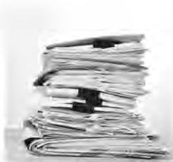
111 Kilometer Akten 1,7 Millionen Fotos

Seit der Wiedervereinigung: Zugang zu den Stasi-Akten für ehemalige DDR-Bürger