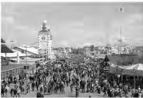
das größte Volksfest der Welt

Grund: mehrere Terror-Anschläge in europäischen Großstädten