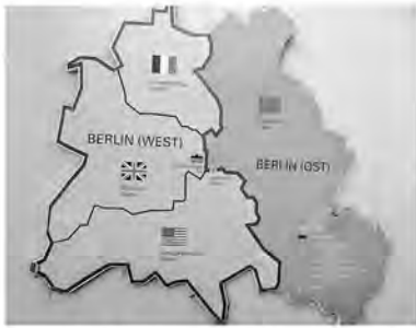
1961–1989: die Mauer rund um West-Berlin