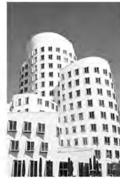
Elegante Büros im „Zollhof“ in Düsseldorf