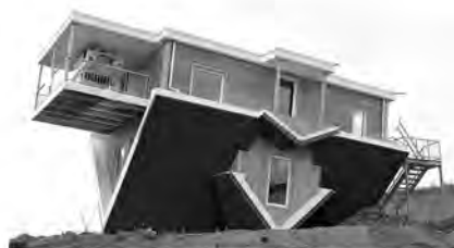
„Kopfstand“ in Wertheim in Baden-Württemberg