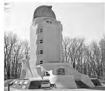
Observatorium im „Einstein-Turm“ in Potsdam