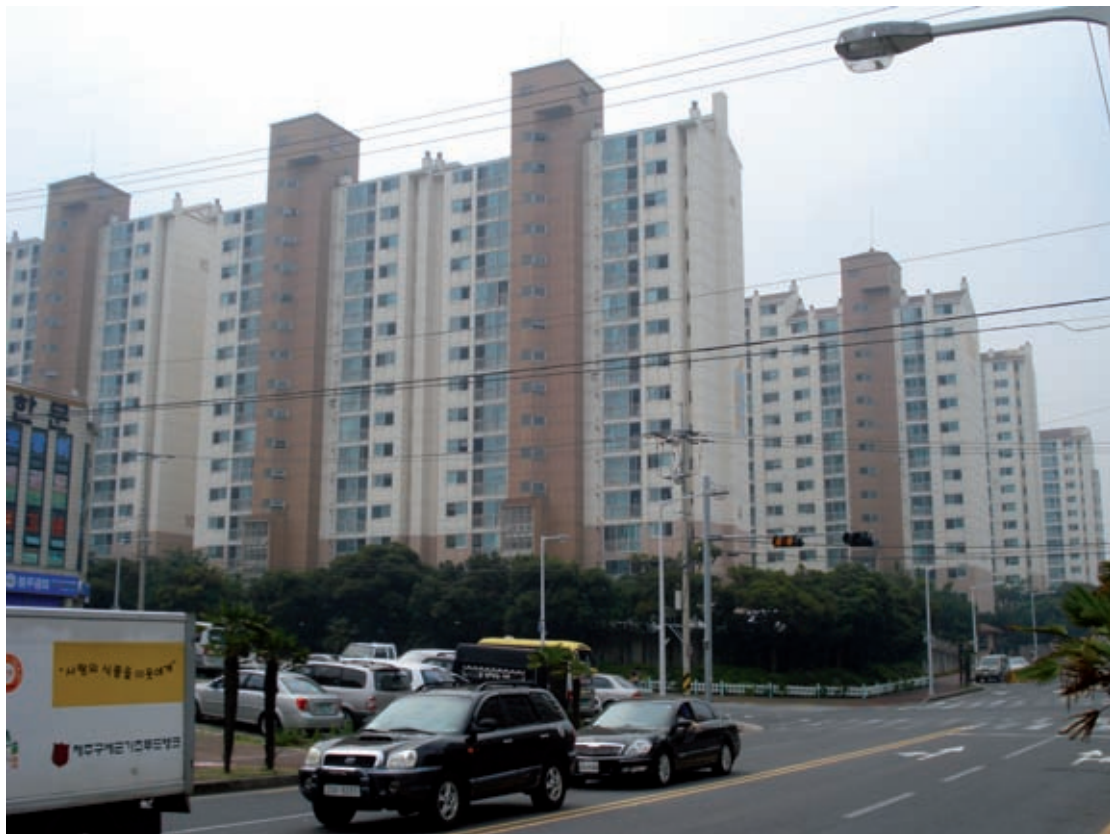
Housing units in Jeju City from the Asian “tiger” period

In Seoul and other South Korean cities attention has been paid to improving the appearance of the streets, while urban parks have been added, some of which celebrate Korean culture. Transport systems have been made more environmentally friendly.