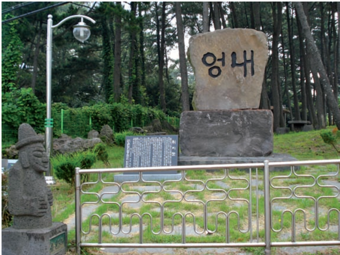
New urban park celebrating local cultural traditions in Jeju City