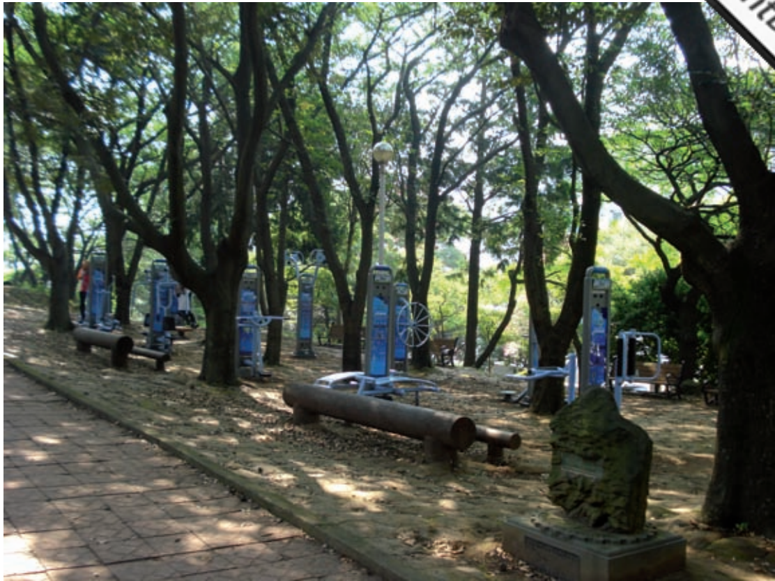
Exercise equipment, Shammu Park, Jeju City