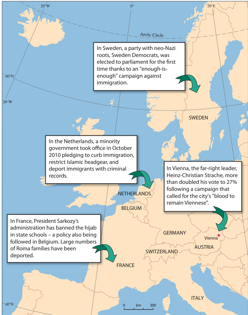
Source: Adapted from articles by Ian Traynor and Matthew Weaver in The Guardian online October 17 2010

The German Chancellor is not alone in her views regarding multiculturalism in Europe. Recent electoral breakthroughs in 2010 in the Netherlands, Sweden, Austria, France and Italy for parties with anti-immigration policies reflect a backlash against ethnic minorities. Many want to ban the visible display of ethnic identity – such as the wearing of the hijab* – in public places in order to create a more integrated society.