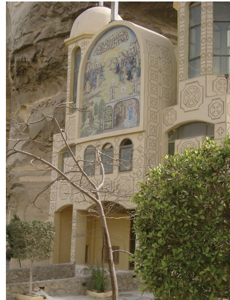
Coptic Church, Cairo

Sporadic sectarian violence between Muslims and Coptic Christians has occurred since President Mubarak was ousted from power in October 2011. One such event resulted in 24 deaths with more than 200 people wounded. These clashes followed the burning of Christian churches. Many blamed an extremist Islamic group, the Salafi, of having orchestrated the violence. The Salafi favour Islamic state rule for Egypt. Copts fear that if this extreme Muslim group gains political power their religious freedom may be restricted even further.