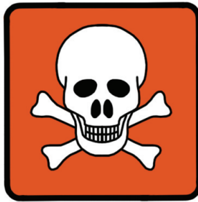
Toxic or Poison