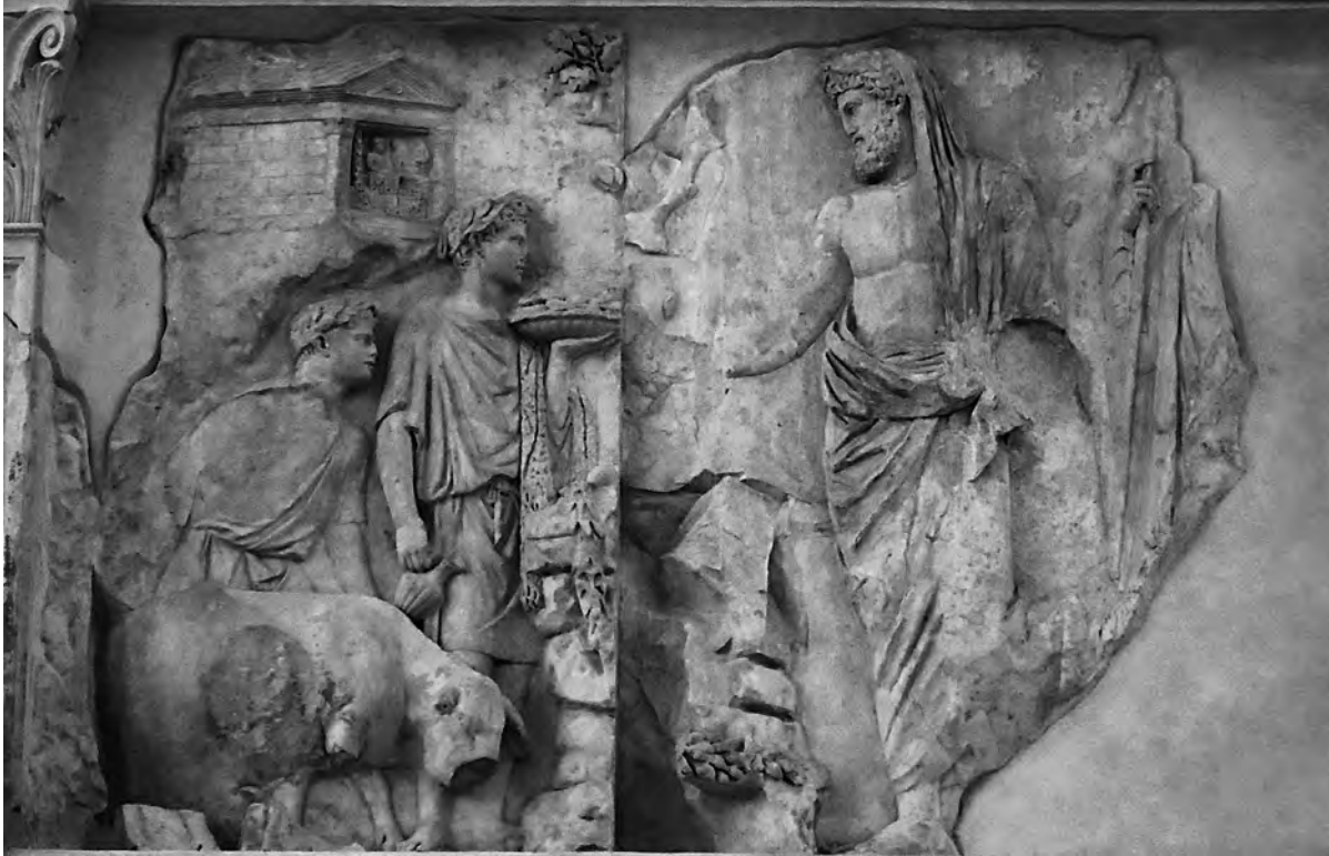
A panel of relief sculpture from the Ara Pacis Augustae .

1 Study the image below, and answer the questions which follow: