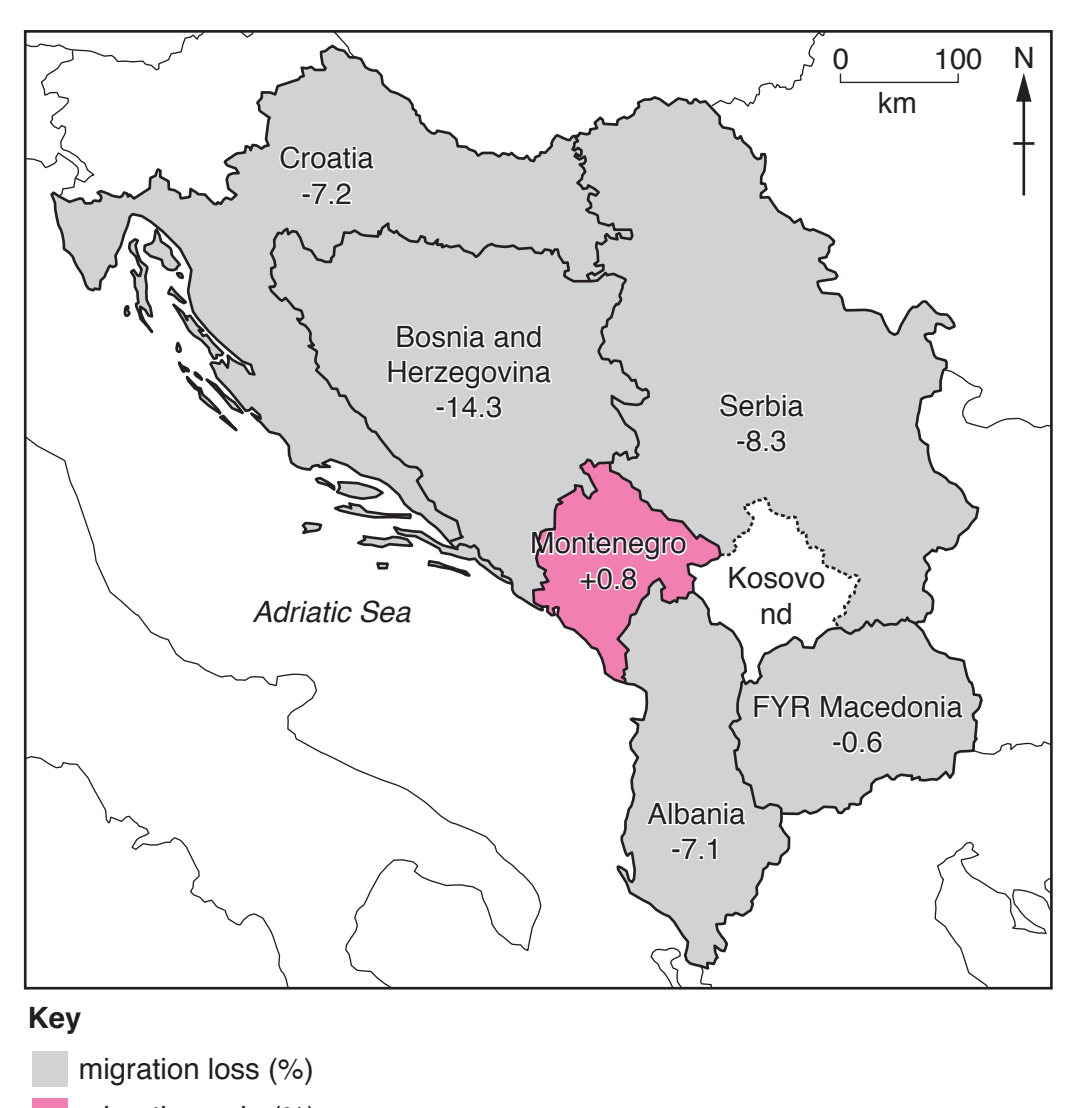
Fig. 2.1 for Question 2 Migration losses and gains for six countries in Europe, 2000–10