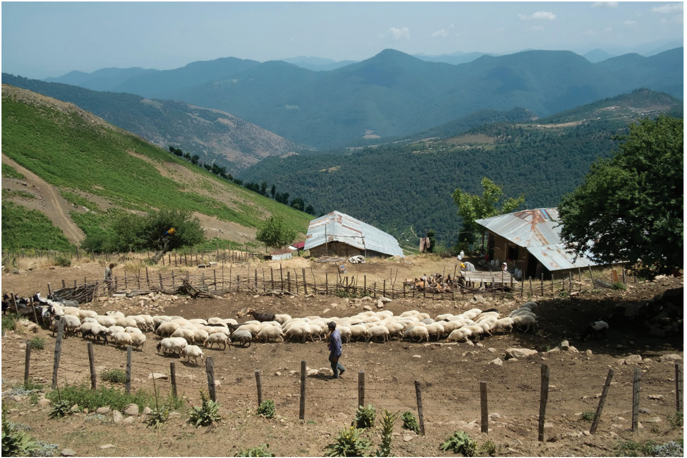
A pastoral farm in Iran, an MIC in the Middle East