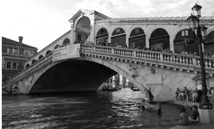
Rialto Bridge, Venice

Refer to Fig. 2, an article on Venice, Italy.