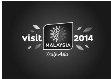
Fig. 2 for Question 2

For over twenty years the Ministry of Tourism of Malaysia has recognised the importance of shopping as a motivator for international travel. This is why, in addition to promoting Malaysia's rich cultural heritage and diverse modern city attractions, the Malaysian Government has, since 1990, promoted the Malaysia Mega Sale Carnival.