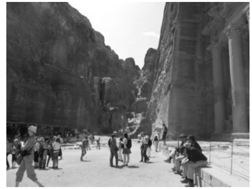
Visitors in Petra

Shop selling authentic Bedouin crafted silver in Petra.