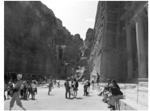
Visitors in Petra

Shop selling authentic Bedouin crafted silver in Petra.