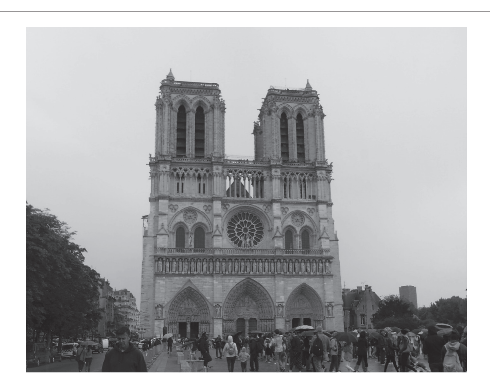
Notre Dame Cathedral, Paris