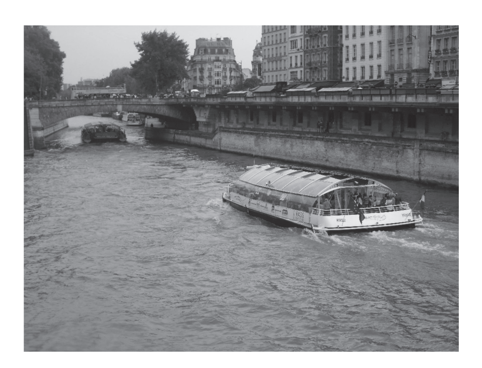
Boat Trips on the River Seine, Paris