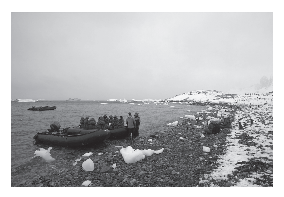
Fig. 3.1 for Question 3