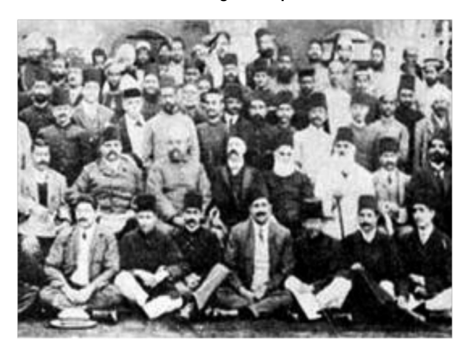
The Founders of the Muslim League

British rulers brought about problems when they tried to make changes. These often increased hostility between Muslims and Hindus in Bengal. The Partition of 1905 led to the formation of the Simla Demands of 1906 and to the All-India Muslim League. However, there was co-operation between Muslims and Hindus for political reform during the First World War, and a pact was signed in 1916. Muslims and Hindus were both disappointed by the reforms of 1919. The Khilafat movement was supported by people from both religions. The Nehru Report resulted from an all-party conference. From 1937 the Muslim League re-organised itself, and its leader put forward a 'Two Nation' theory that was to lead to the creation of an independent Muslim state after the Second World War.