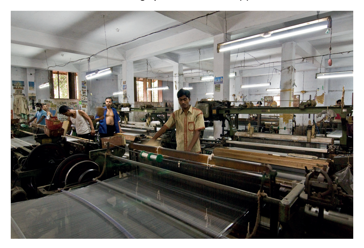
Photograph B for Question 4(a)

Permission to reproduce items where third-party owned material protected by copyright is included has been sought and cleared where possible. Every reasonable effort has been made by the publisher (UCLES) to trace copyright holders, but if any items requiring clearance have unwittingly been included, the publisher will be pleased to make amends at the earliest possible opportunity.