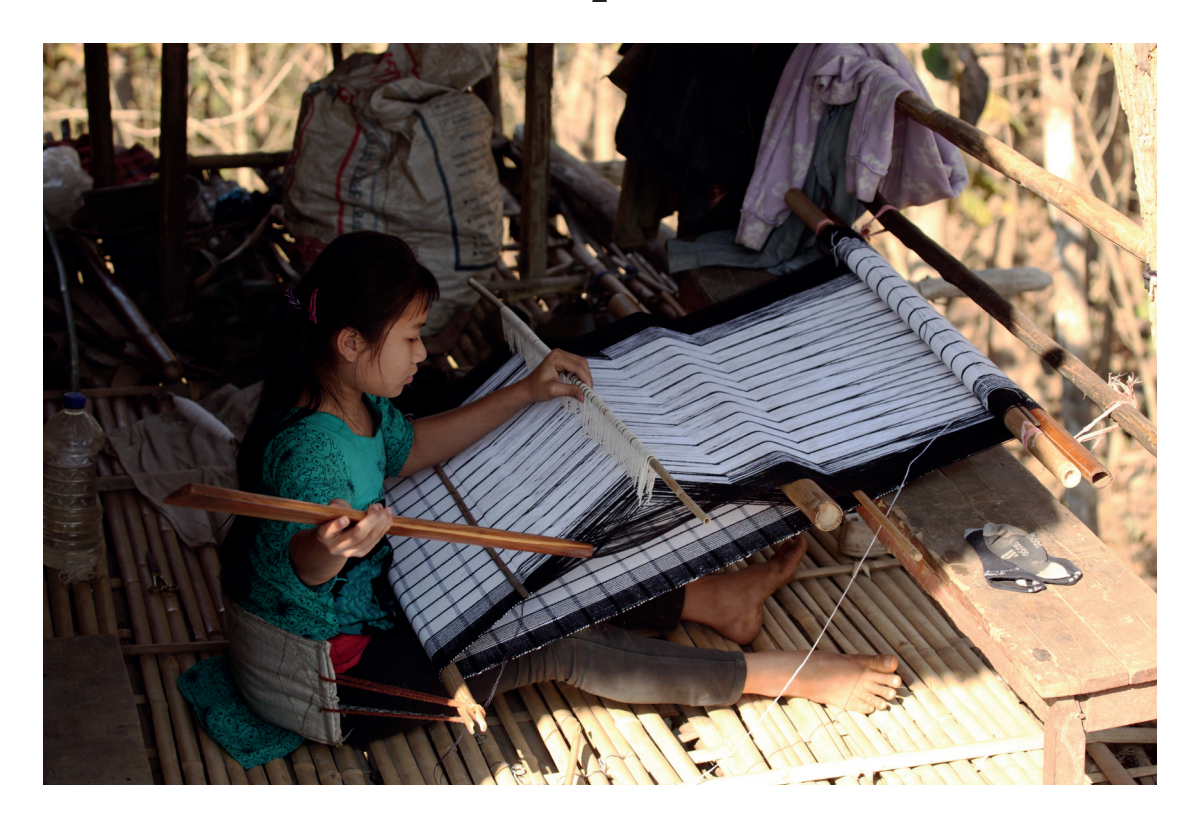
Photograph A for Question 4(a)