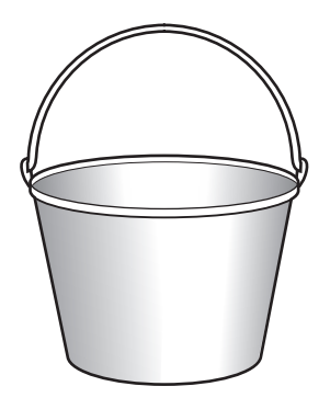
zinc plated bucket