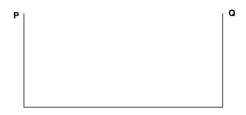
Fig. 4 for Question 3