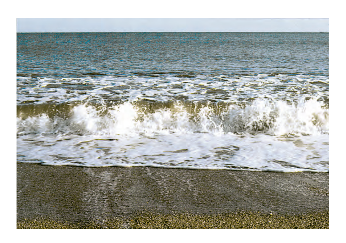
Photograph A for Question 3