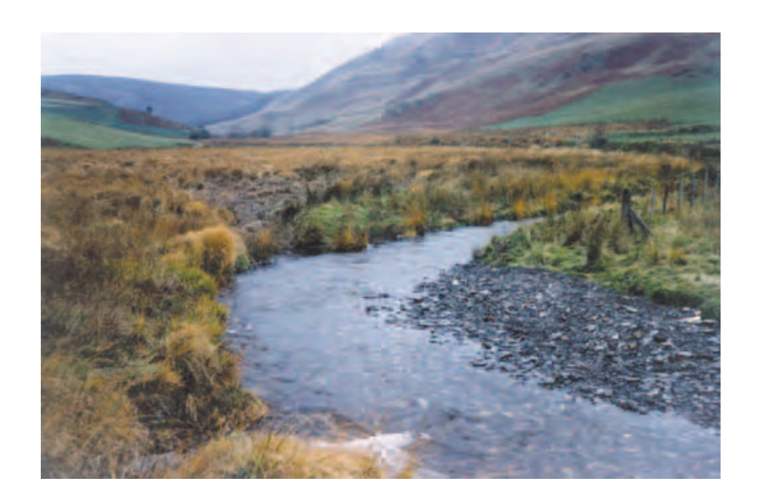
Photograph A for Question 2