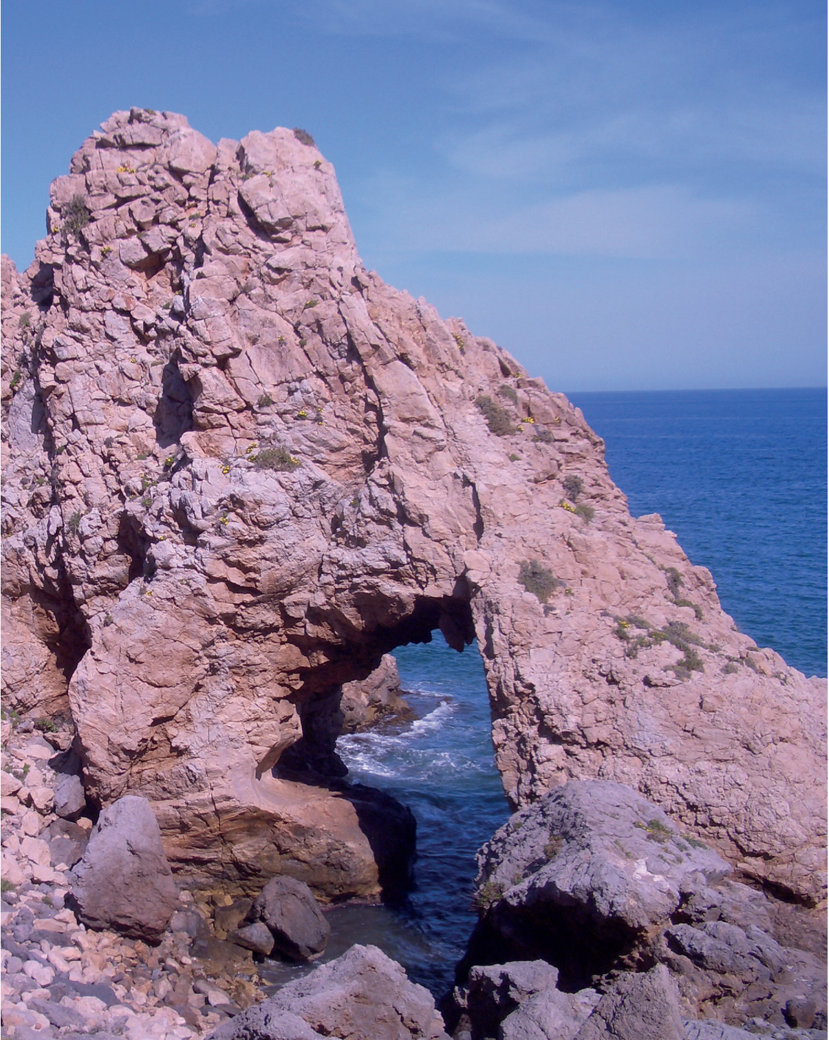
Photograph A for Question 3