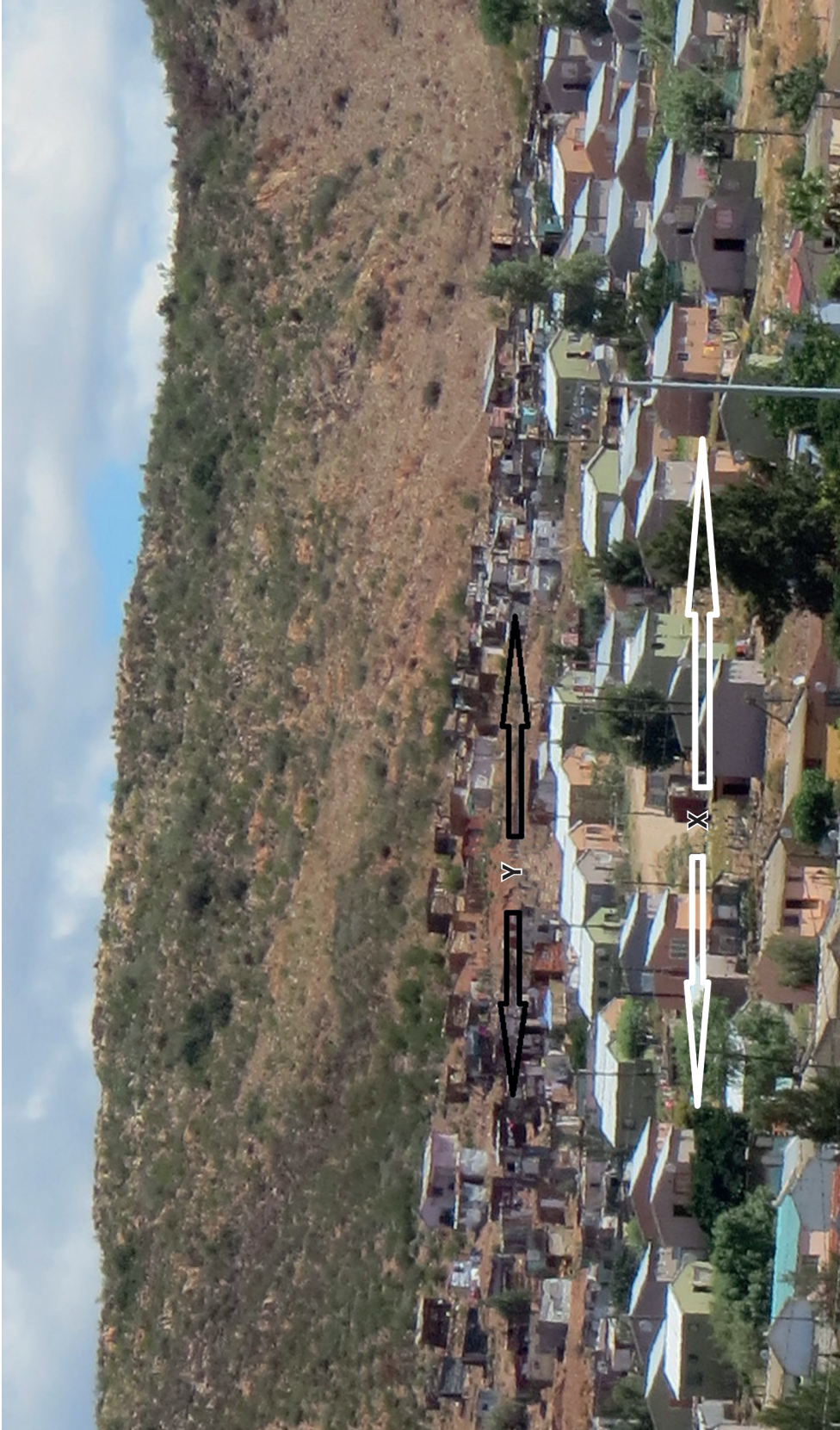
Photograph A for Question 3