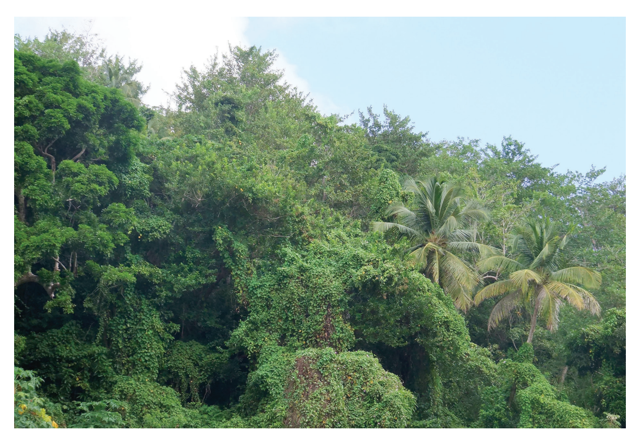
Fig. 5.2 for Question 5