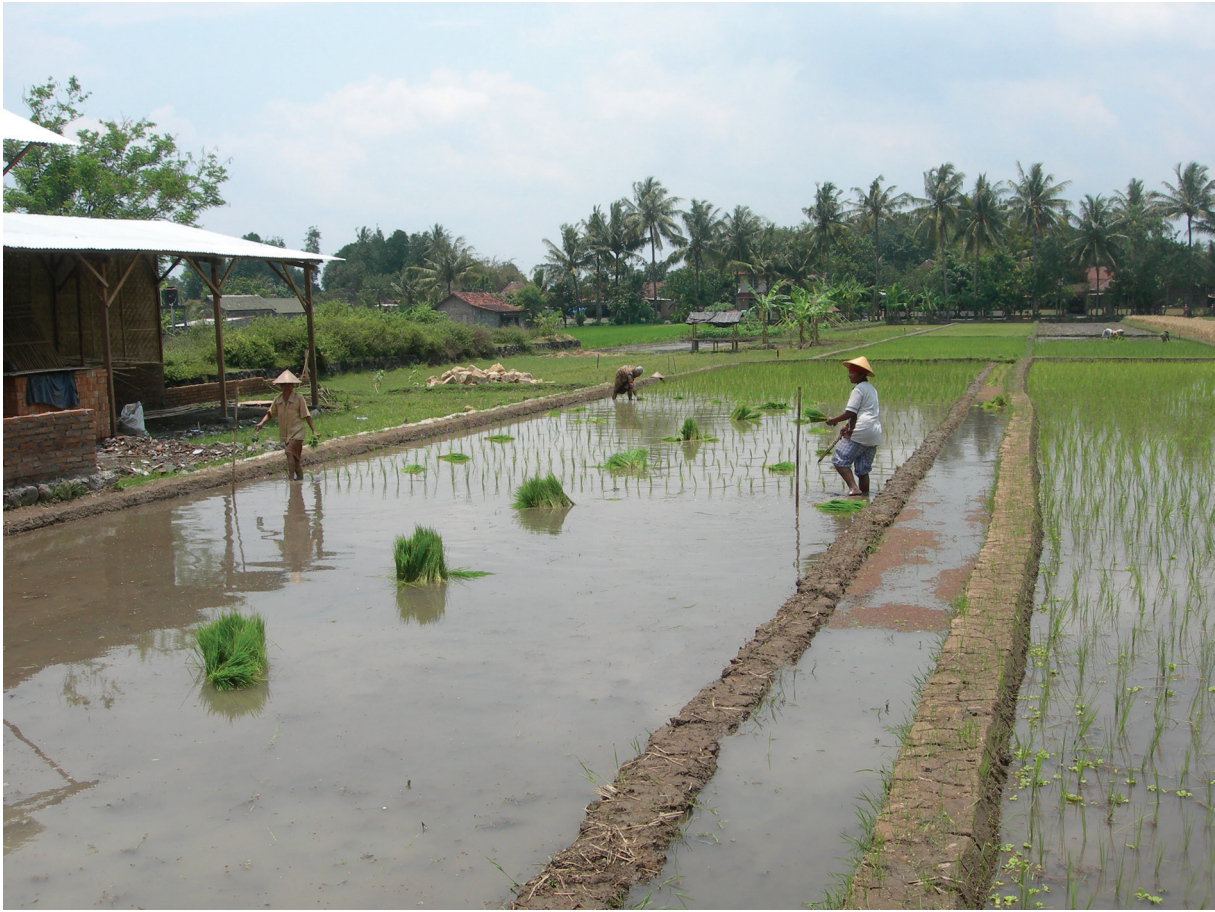
Fig. 5.2 for Question 5