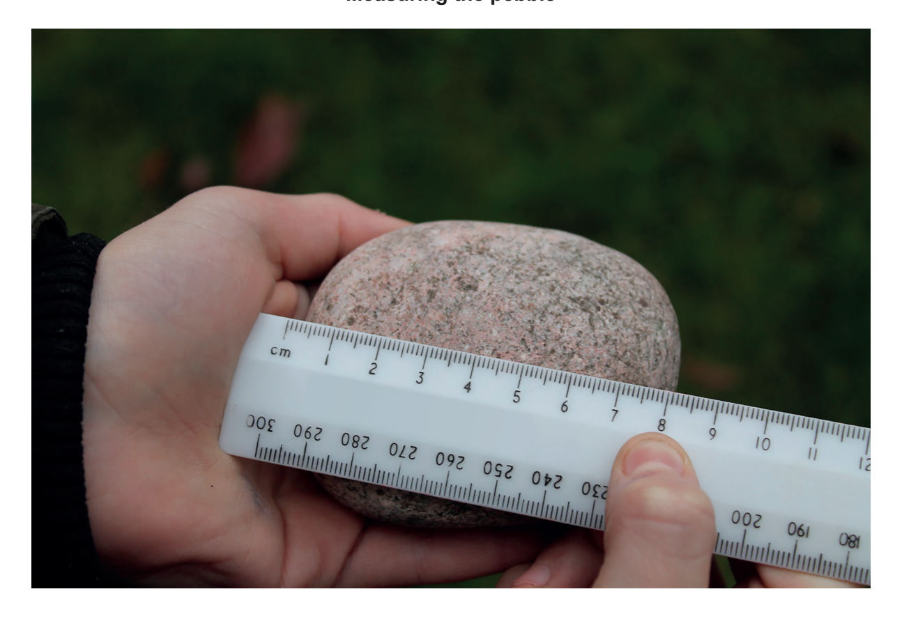
Fig. 2.3 for Question 2 Measuring the pebble