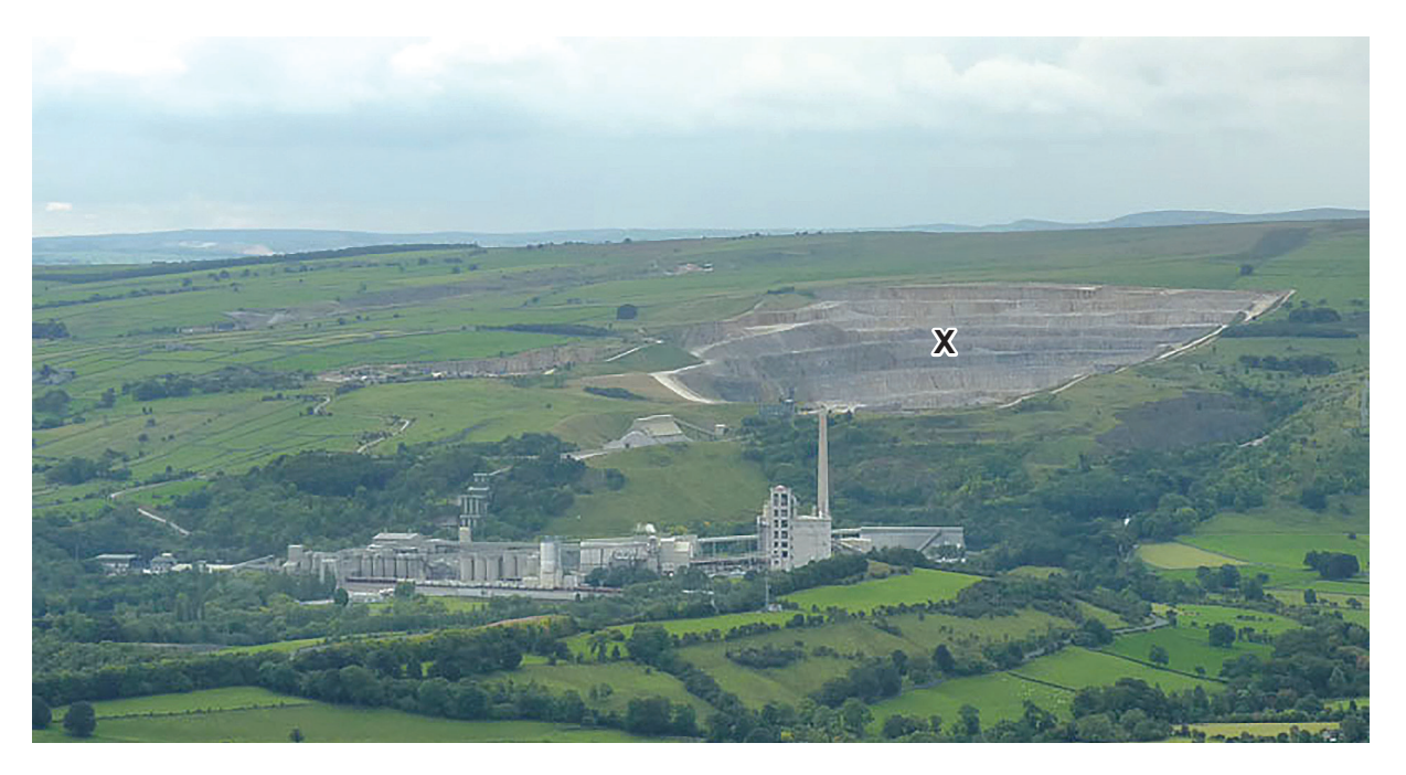
Table 2.1 for Question 2