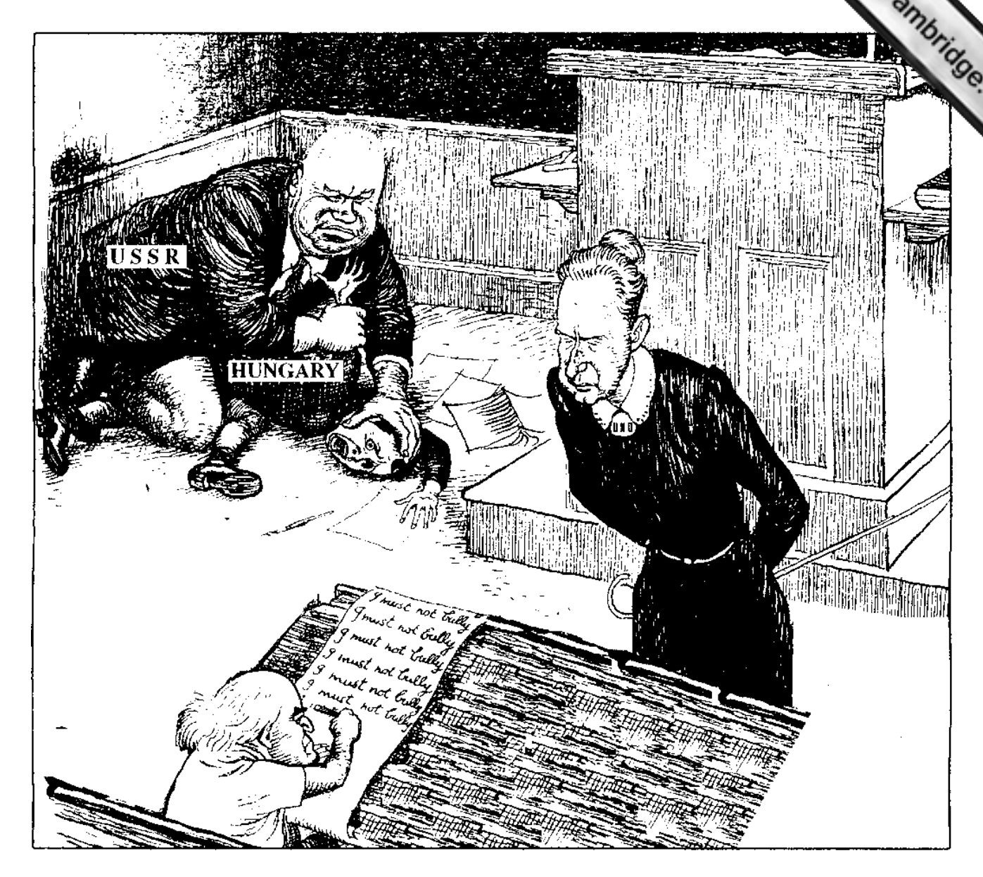
A cartoon from a British magazine, November 1956. The teacher, representing the United Nations, is punishing Israel, a small nation, for invading Egypt.