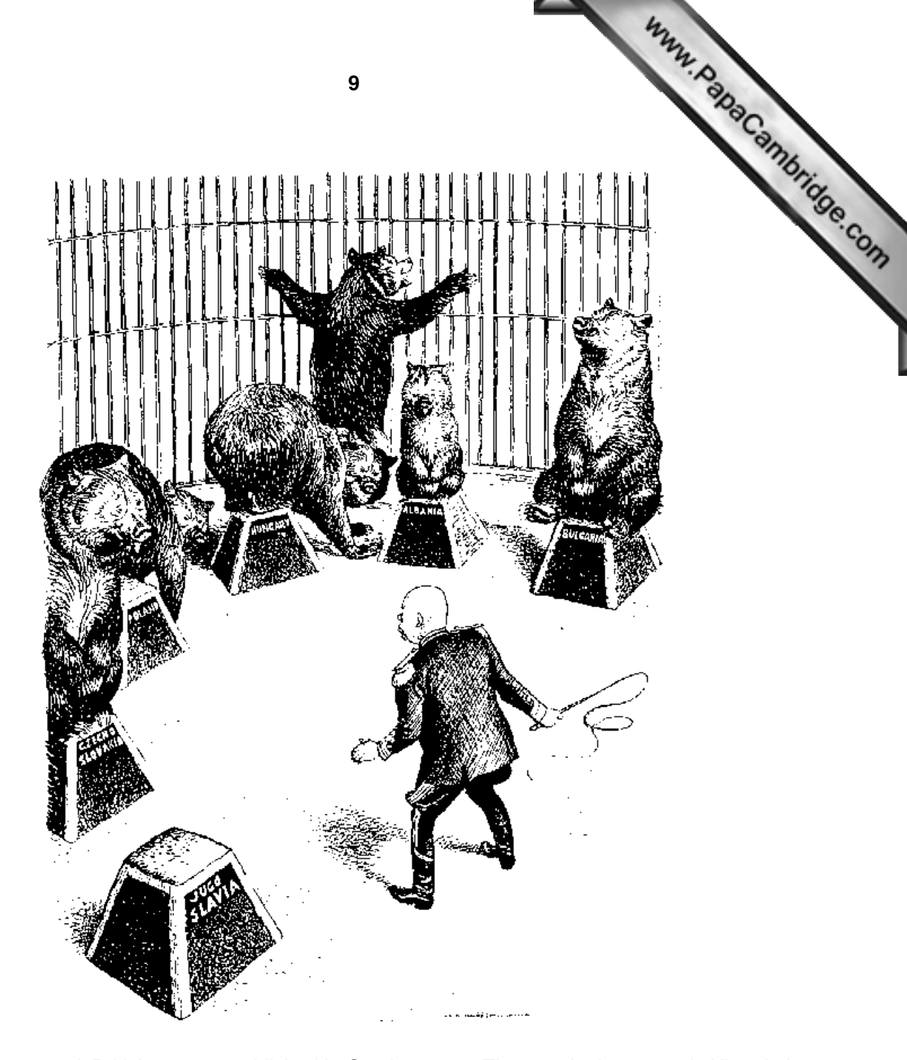
A British cartoon published in October 1956. The man in the centre is Khrushchev.