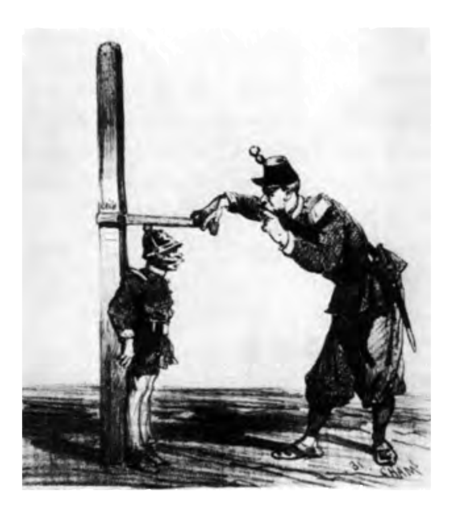
A British cartoon published in 1867. France is saying to Prussia: 'Now you are big enough. You must not get any bigger. I'm telling you this for your health.'