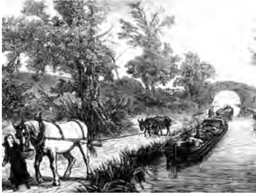
An early nineteenth-century drawing of canal barges.

22 Study the picture, and then answer the questions which follow.