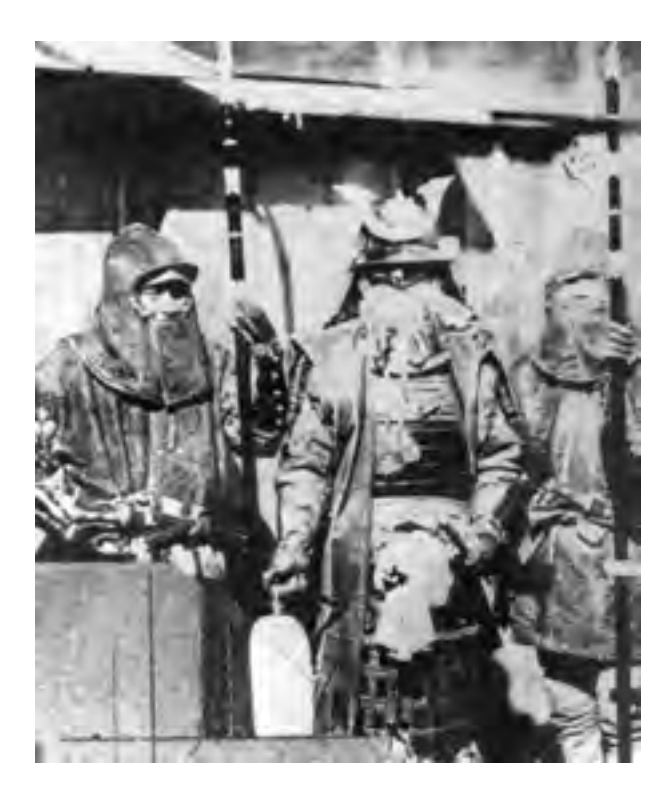
A photograph of Japanese warriors in 1868.