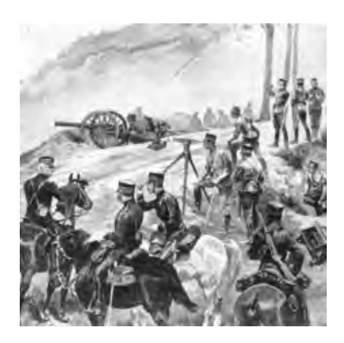
A drawing of Japanese soldiers in 1904.