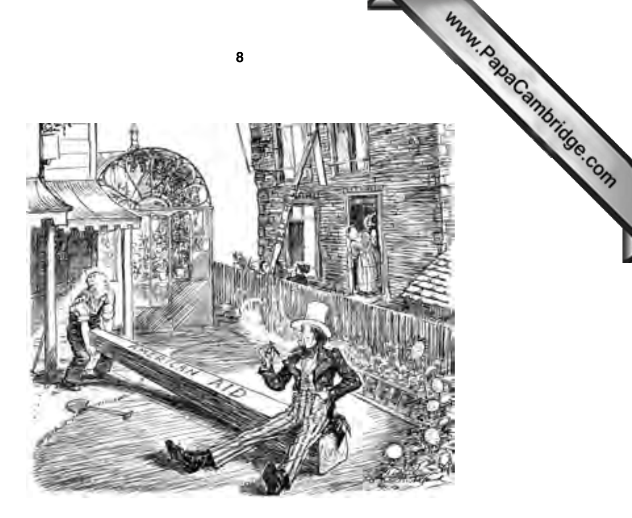
An American cartoon published in 1947. The man on the left is Marshall. He is saying 'Come on Sam! It's up to us again.'