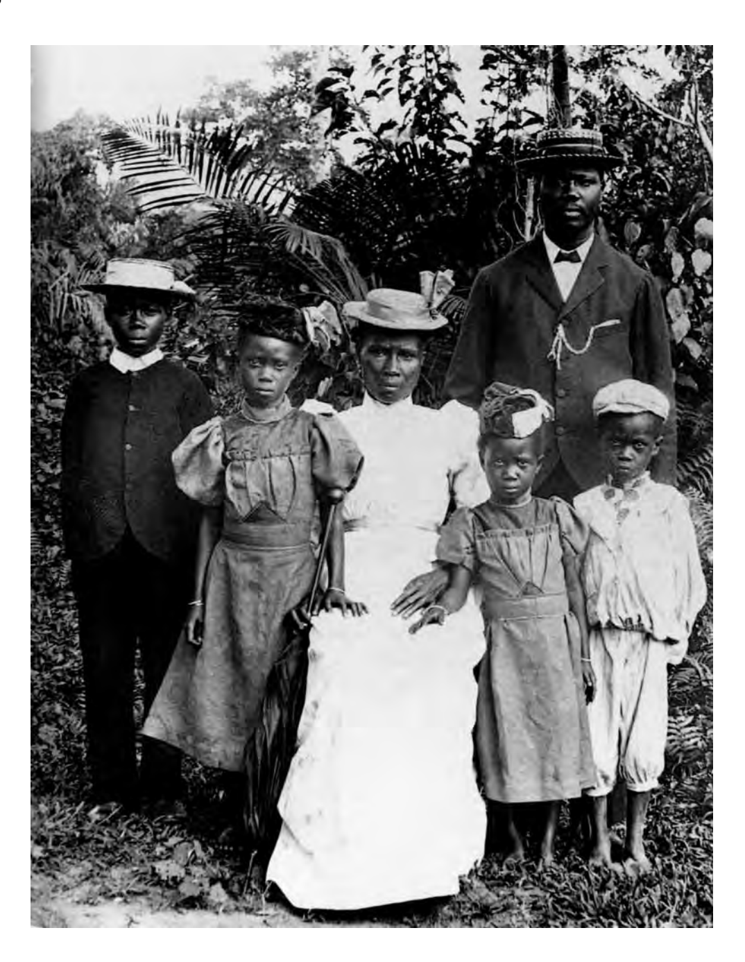
Photograph taken in 1898 of an African family who lived with Christian missionaries who