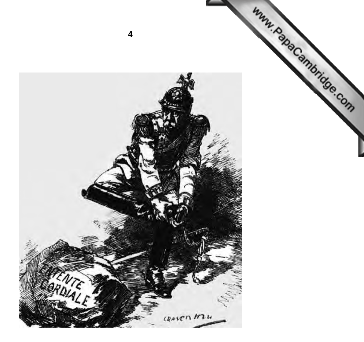
A British cartoon published in August 1911. The figure representing Germany is saying 'It's rock. I thought it was going to be paper.'