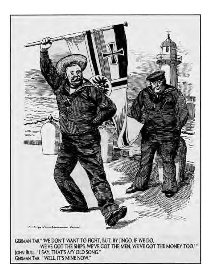
A British cartoon published in March 1909. 'German Tar' is a German sailor. 'John Bull' represents Britain.