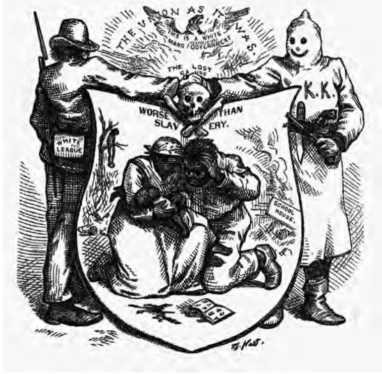
A cartoon from an American magazine published in 1874. The cartoon is called 'Worse than Slavery'.