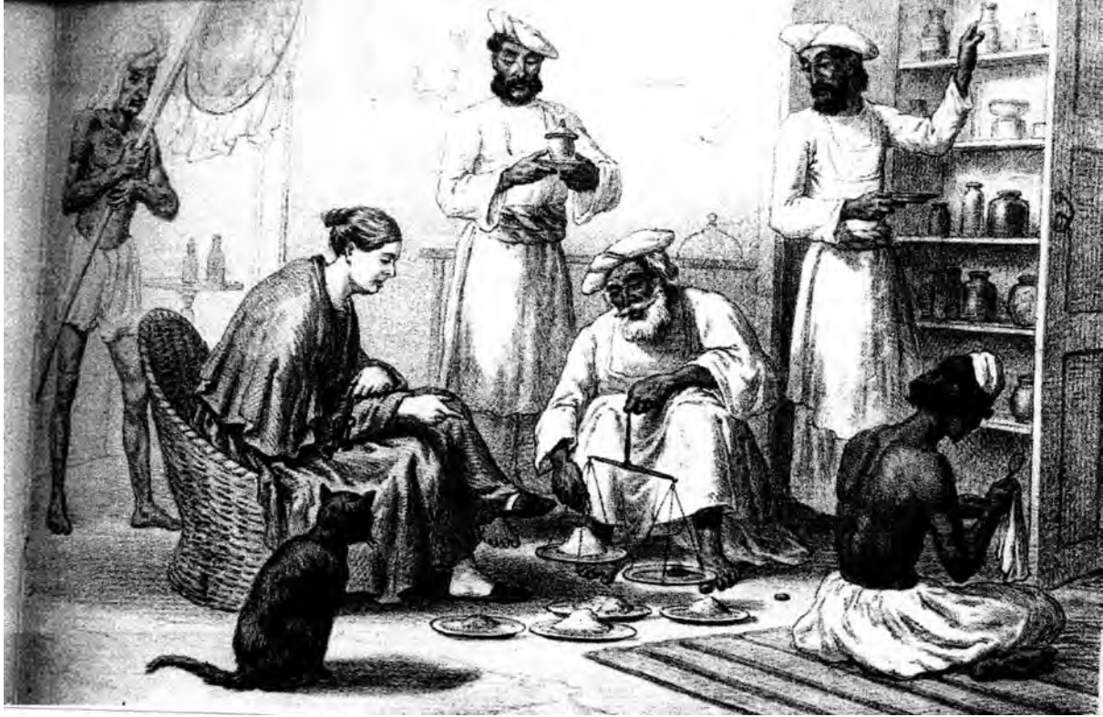
A judge's wife in early nineteenth-century India surrounded by her servants.