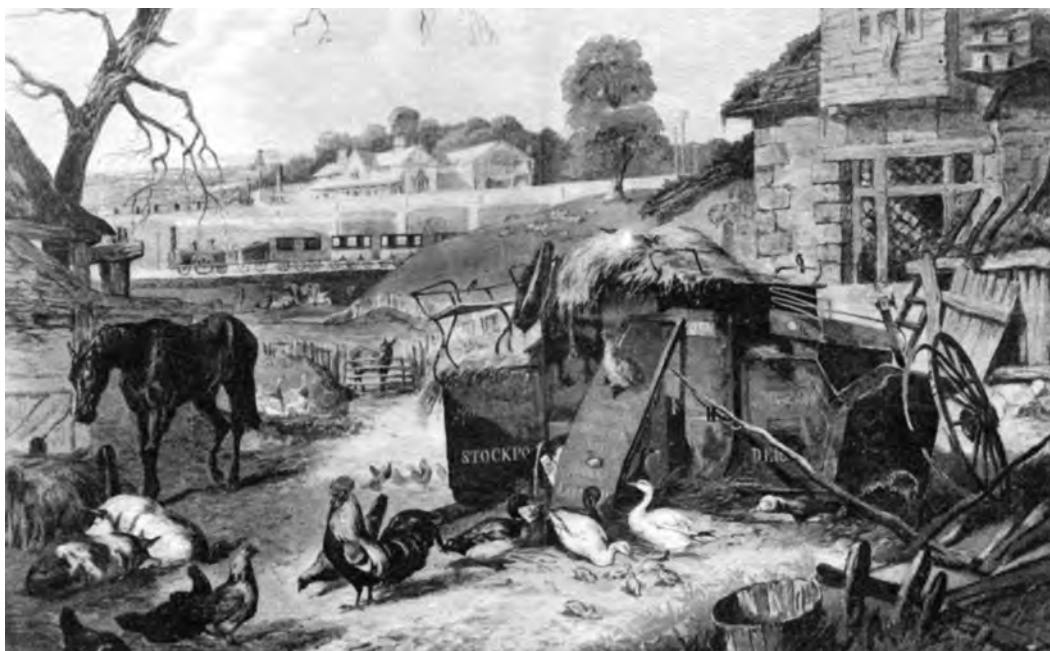
A painting of 1850 called 'Past and Present Through Victorian Eyes'.