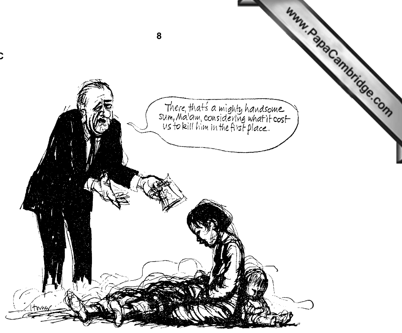
(The US is spending more than $40,000,000 per day on the war in Vietnam; compensation payments for South Vietnamese civilians killed 'by mistake' are $34 per head.)

A British cartoon published in October 1966.