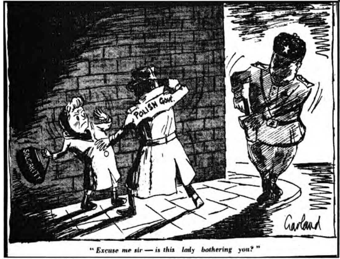
A cartoon published in an English newspaper in December 1980. The Russian soldier is saying 'Excuse me sir - is this lady bothering you?'.