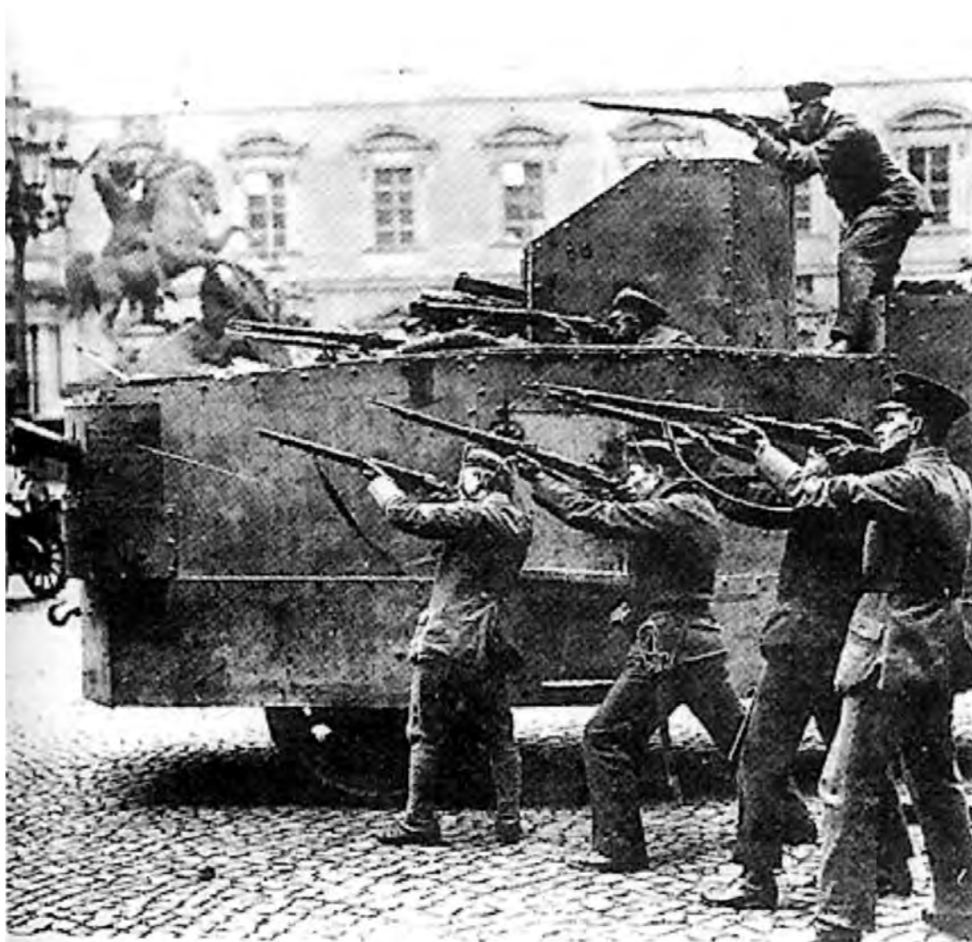
The Freikorps in action in 1919.