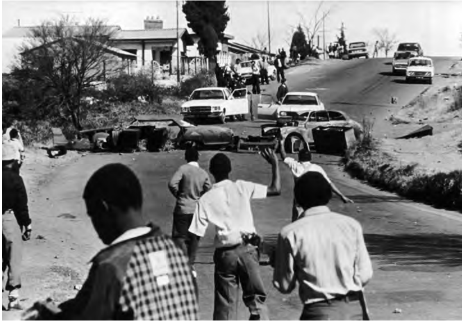
High school students on the streets of Soweto, 1976.

18 Study the photograph, and then answer the questions which follow.