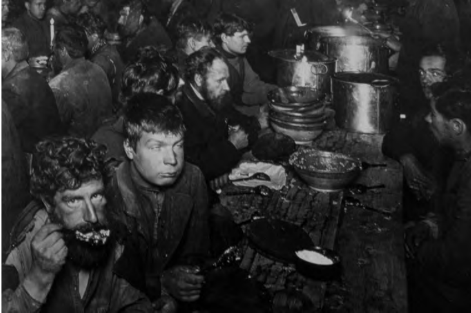
A boarding house for industrial workers, Moscow 1911.