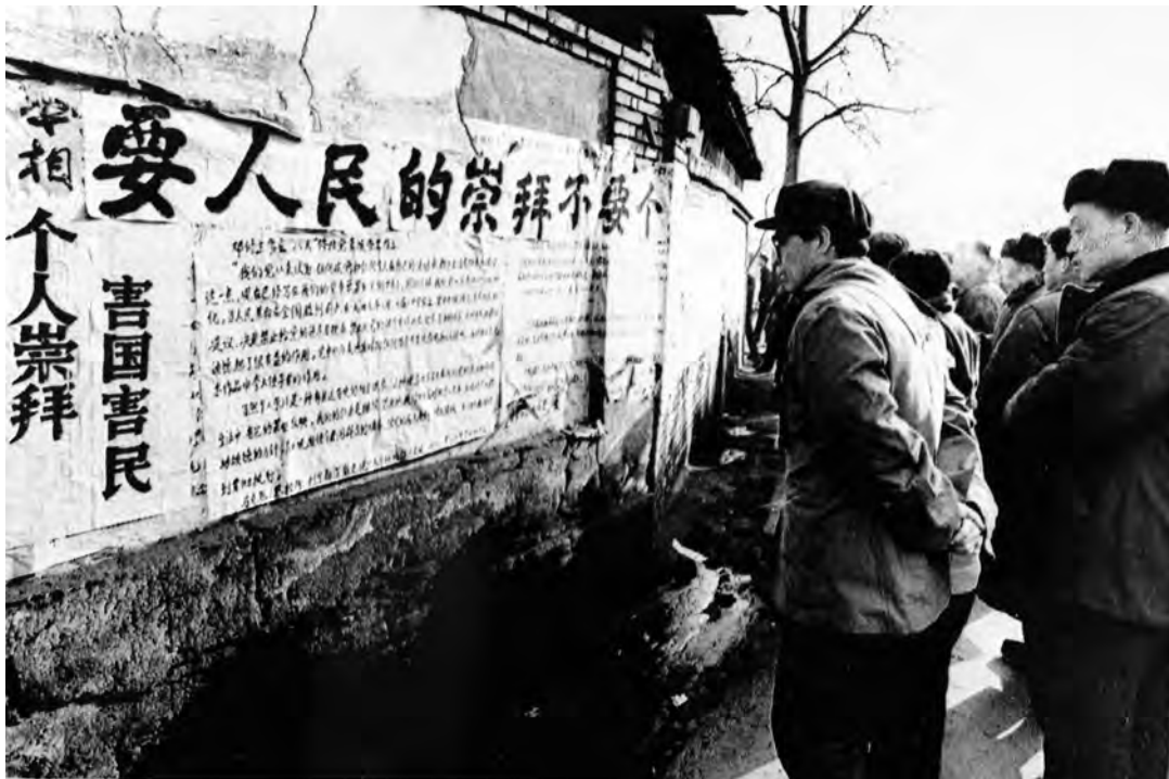
The 'Democracy Wall' in Beijing, 1979.

16 Study the photograph, and then answer the questions which follow.