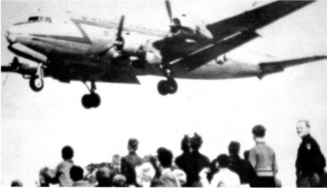
West Berliners watching a US cargo plane landing.