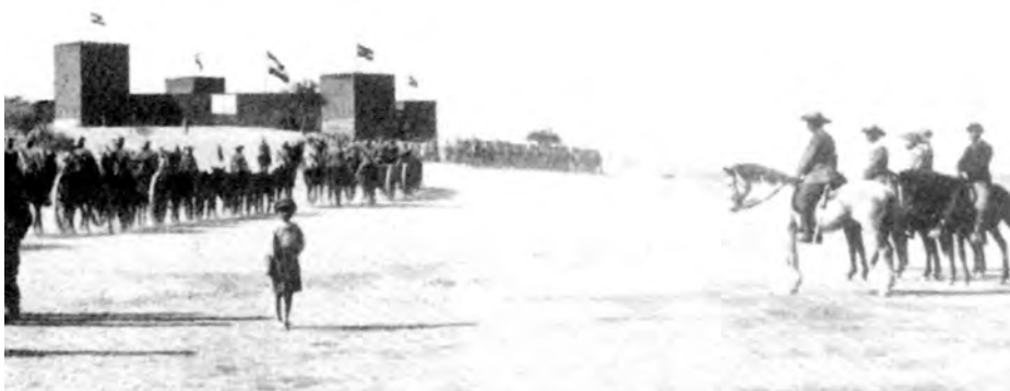
The German fort at Windhoek, 1898.

19 Study the photograph, and then answer the questions which follow.