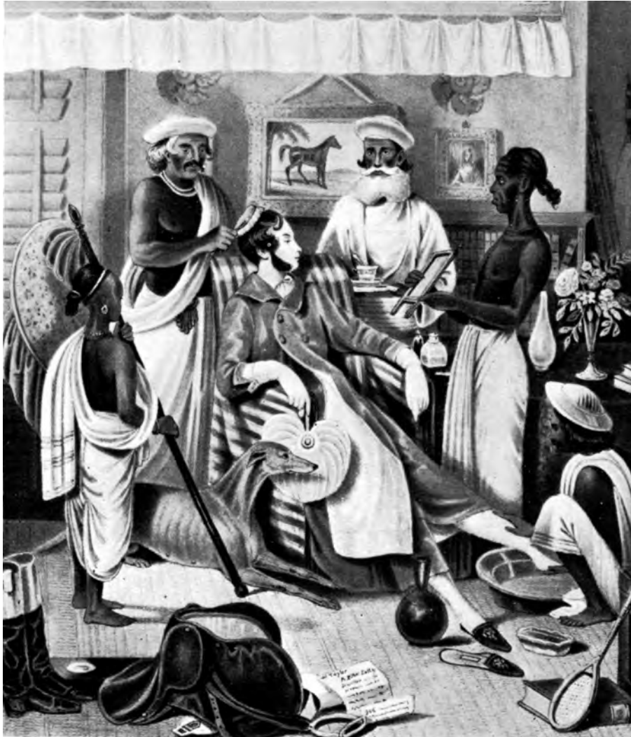
A young Englishman in India in the 1840s being dressed by his personal servants.