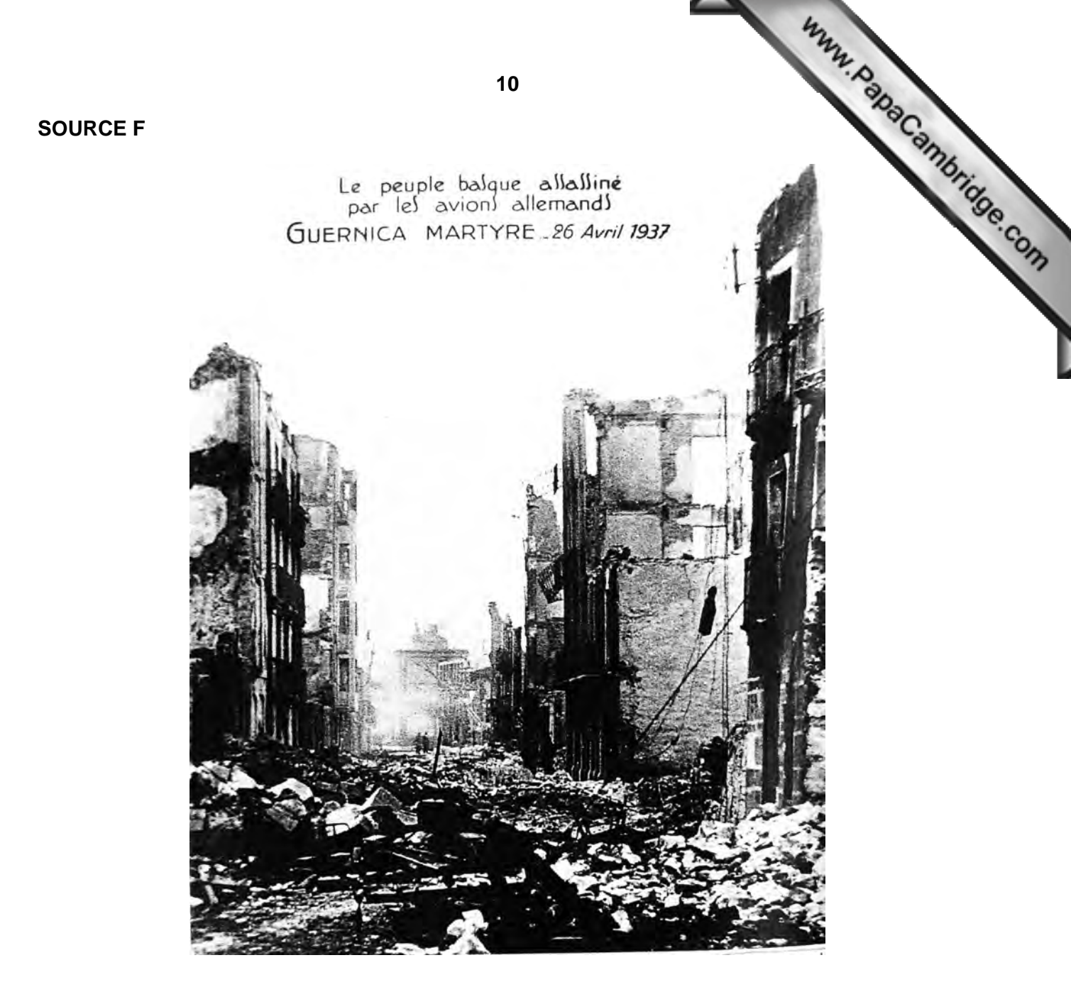
A postcard published in France shortly after the attack on Guernica. The writing at the top says, 'The Basque people murdered by the German planes. Guernica martyred – 26 April 1937.'