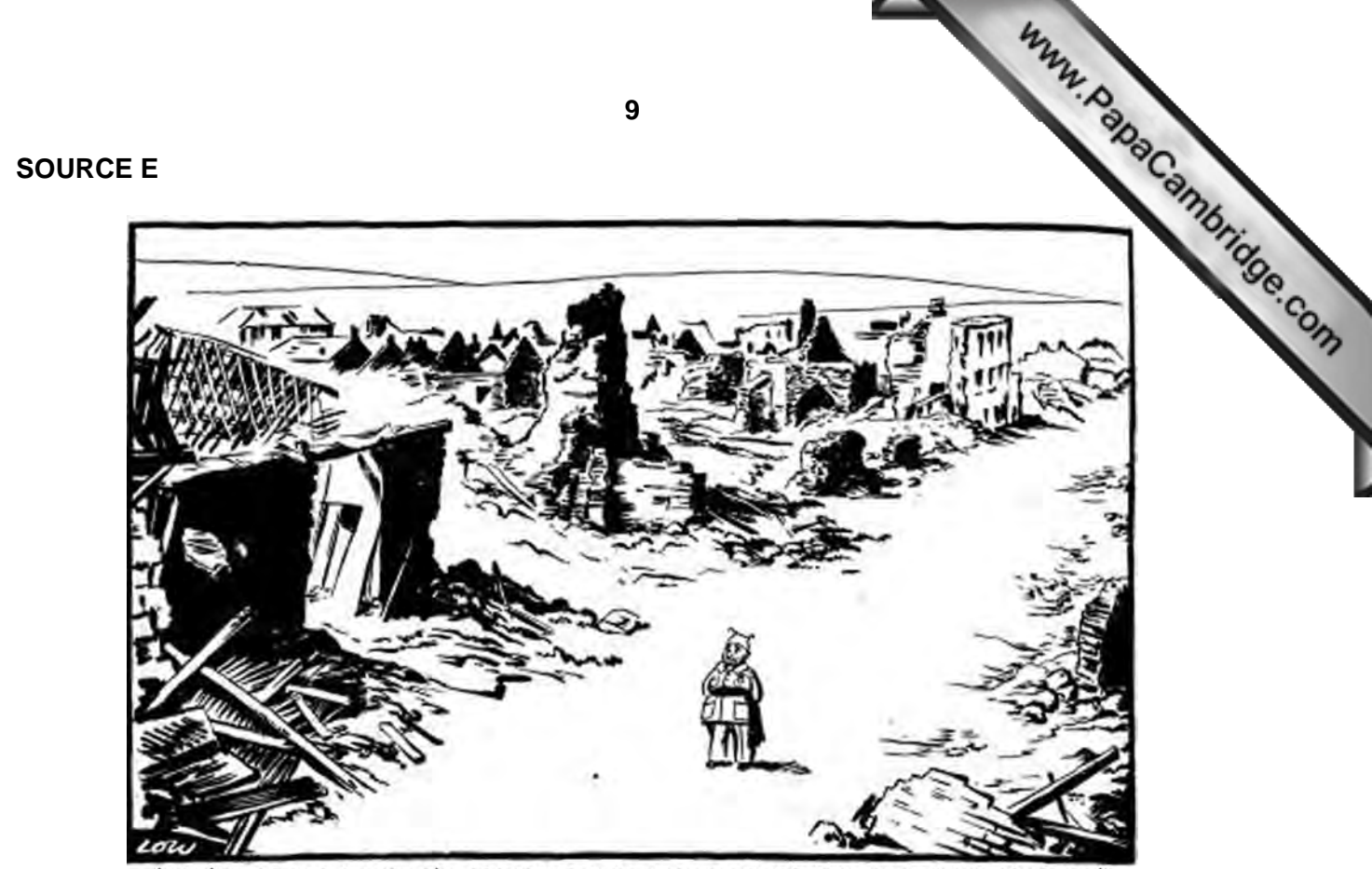
"YOU'VE GOT TO ADMIT I'M BRINGING PEACE TO THE POOR AND SUFFERING BASQUES."

A cartoon published in Britain on 21 June 1937. The figure in the cartoon is Franco.