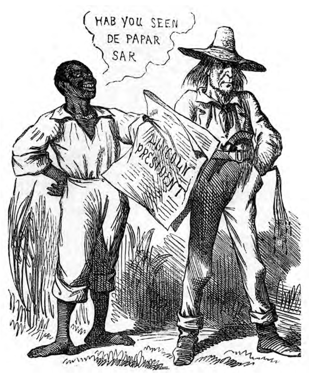
A cartoon published in December 1860. It shows a slave talking to the slave owner.