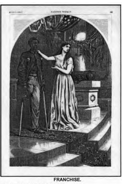
Columbia - "Shall I Trust These Men, And Not This Man?"

A cartoon published in 1865. The woman represents the United States. She is saying 'Shall I trust these men, and not this man?' On the left are Confederate leaders asking to be pardoned. On the right is a black Union soldier who still cannot vote.