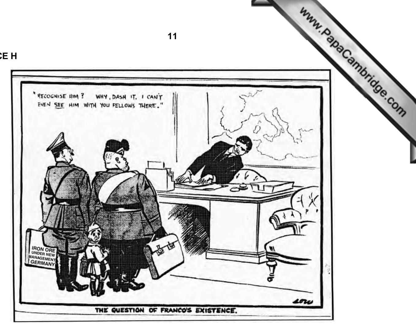
A cartoon published in Britain in July 1937. The figure behind the desk represents the British Government.