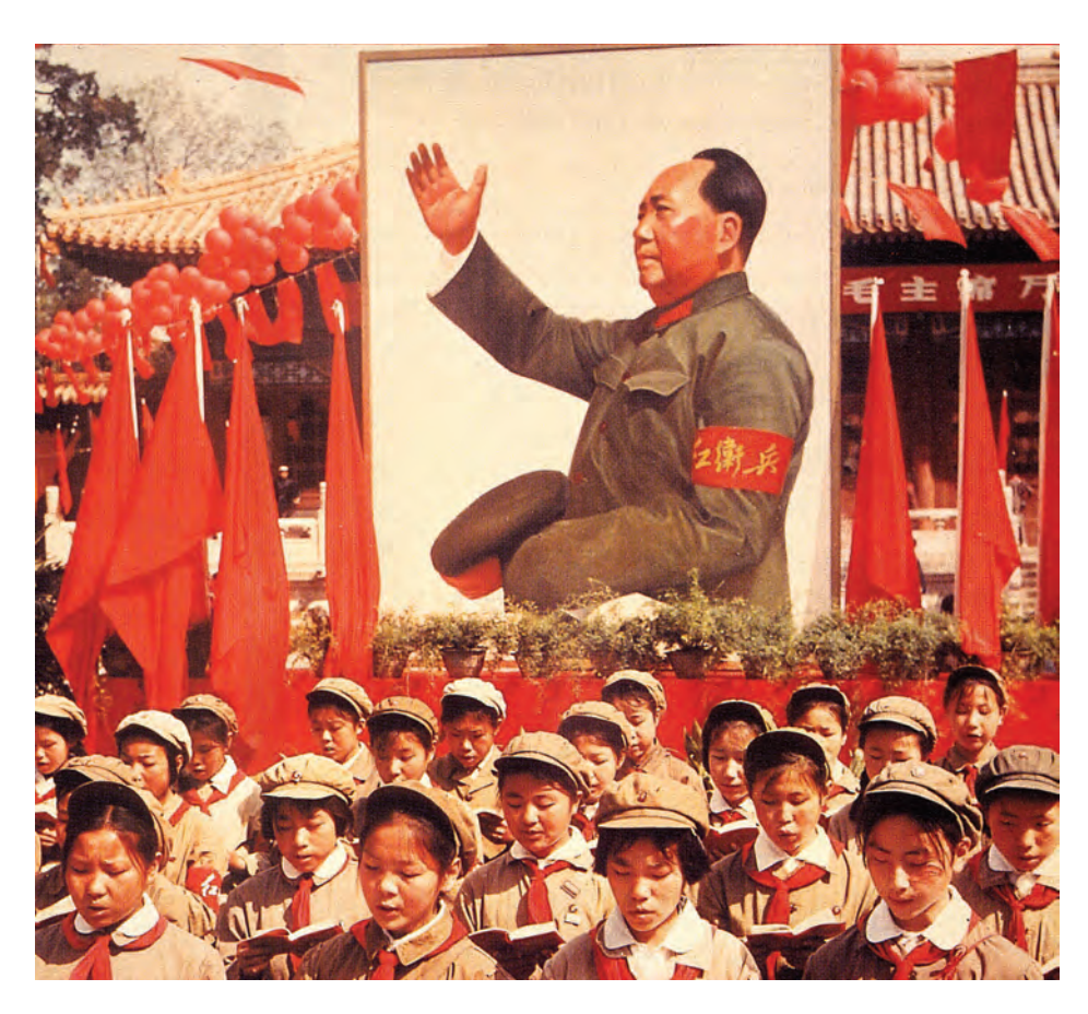
Red Guards read the teachings of Mao during the Cultural Revolution, beneath a poster of the Chinese leader.