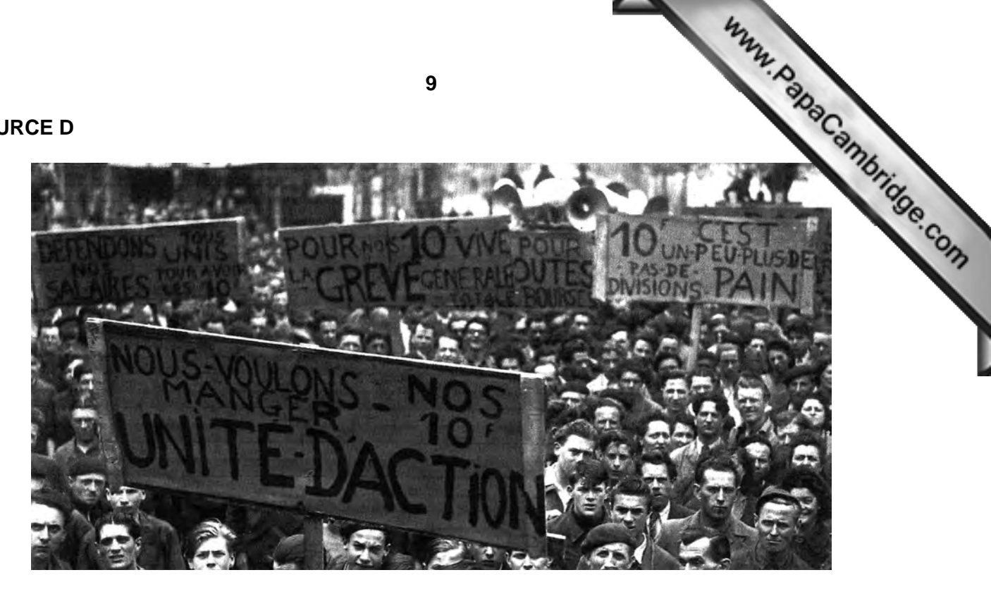
A photograph of workers in Paris demonstrating in 1947 for more pay, more bread and more united action by left-wing groups.