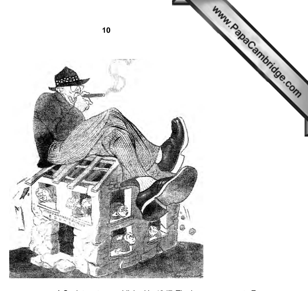
A Soviet cartoon published in 1947. The house represents Europe.