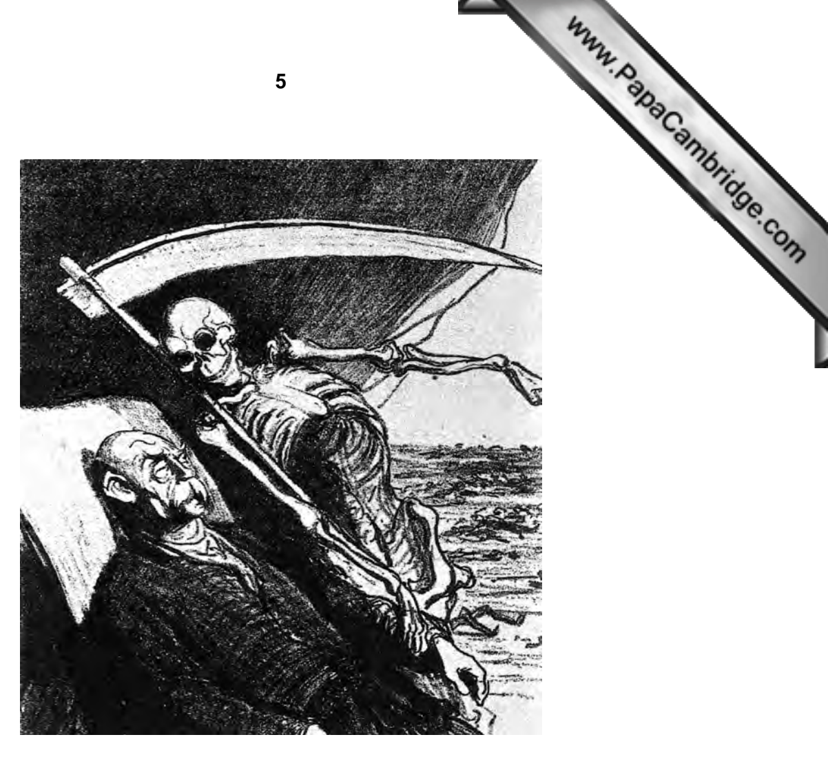
A cartoon from the early 1870s showing Death thanking Bismarck for the thousands killed in the course of unification.