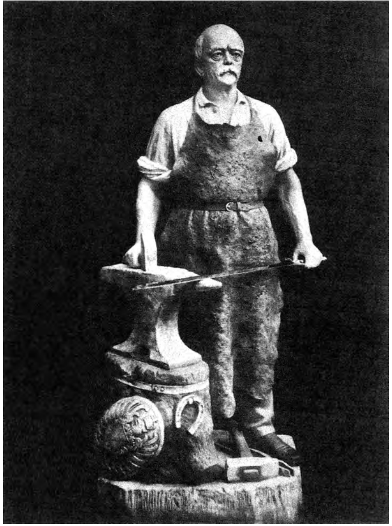
A statue of Bismarck from the 1870s. It shows him making preparations for the unification of Germany.