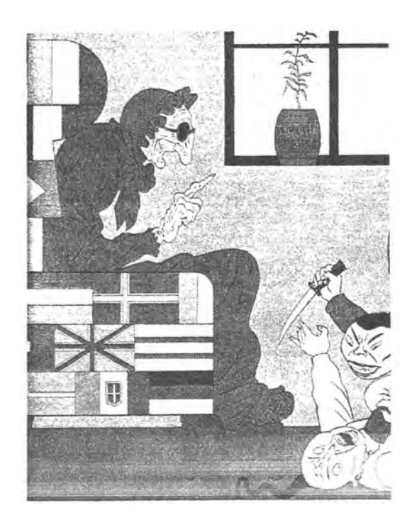
A cartoon published in Germany in January 1933. The League (on the left) is saying 'Naughty Japan! You should warn me next time you want to start a little war.'