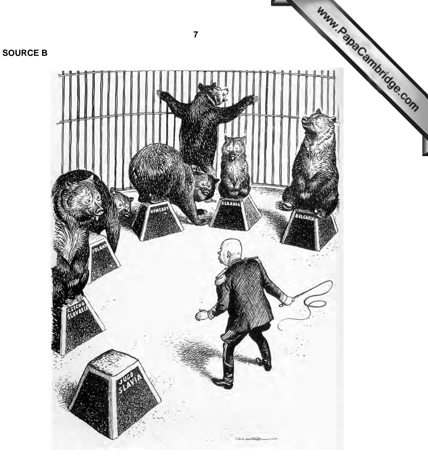
A cartoon from a British magazine, October 1956. The ringmaster is Khrushchev.