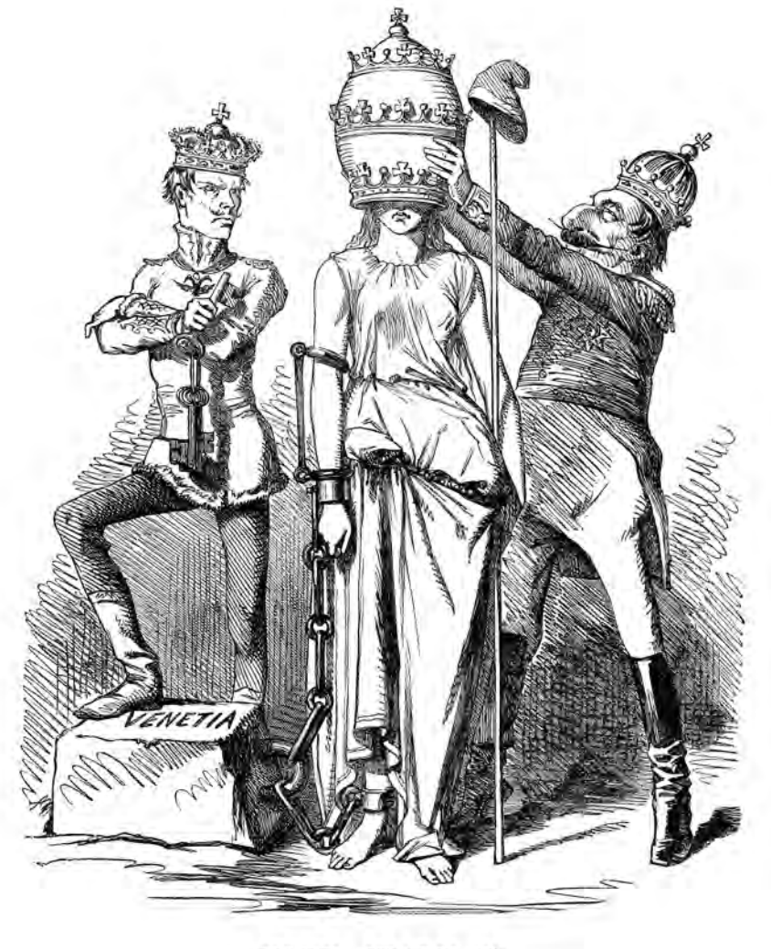
FREE ITALY (?)

A British cartoon published in July 1859. The three figures represent (from left to right) Austria, Italy and Napoleon III. Napoleon is placing the Papal crown on Italy's head.